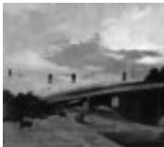
Dusk, Oil on linen, 24"x 26"

The objective in my paintings is not to be limited to the drawing alone. I create expressions, emotions and observations through the exploration of color. The intention is to manipulate the viewer's perception of the image both visually and emotionally. With my color and paint application, I create the illusion of clarity at distances while retaining the elusive qualities up close.