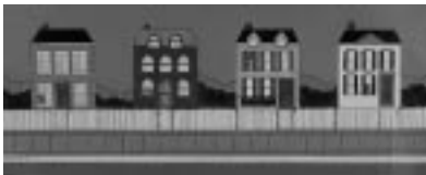
The Neighbors I, Pen and acrylic, 9.5" x 24"

Where we live, how we live—does that define who we are as Americans? My work represents my reality of, and my hope for America.