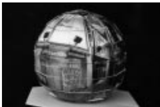
Times Square 2000, PhotoGlobe

I tell visual stories through my photoglobes. My goal is to recreate reality in two and three-dimensional panoramic collages composed of multiple photographs.