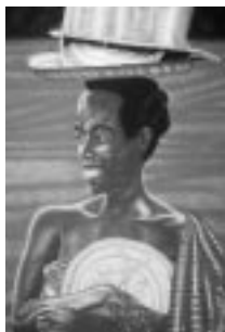
Untitled, Oil pastel

I am privileged to live my life engaged in sublime worship. Man himself is a work of art that is in a continual process of creation. As an artist I have come to understand the dynamic of this wonderful relationship. I have been given the gift and responsibility to create.