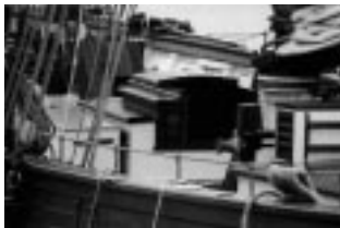
Amistad Cabin, Color photograph

Photography allows me to share my view of the world. My goal is to have people of all cultures appreciate each other—encouraging understanding and imparting the importance of humanity. I capture events as they happen, cataloging the remnants of life.