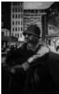
Expectations, Oil on canvas, 30"x 40"

Pablo Picasso said, 'The artist is nothing without the gift, but the gift is nothing without work.' This encouraged me to investigate the world of painting and sculpture. My artwork is infused with exaggerated color, heightened lights, and deep darks to give my work a dramatic appeal. My artistic influences are Georges Braque, Pablo Picasso, and Edgar Degas.