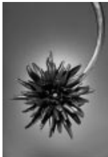
Dahlia, Forged steel, life-size

Natural forms such as flowers, leaves, butterflies, and snakes seem to find their way into my work. Although steel is usually first thought of as an industrial material, I like to draw attention to our connection with it on a human level by creating objects that reveal organic forms.