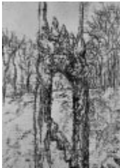
Eye of the Needle, Monotype, 6 \frac{7}{8} "x 4 \frac{7}{8} "

Although I draw the figure from life as a discipline, I mostly work from imagination. Nature is a wellspring, but my work is from inside.